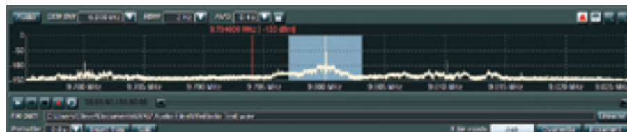
Figure 4 — Close-up of the demodulator window showing the drop-down audio recording window.