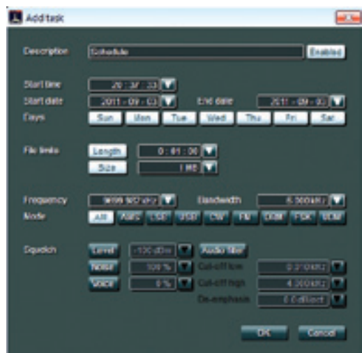
Figure 3 — The Excalibur recording function includes a full-featured scheduler.